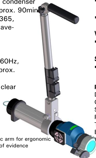
Telescopic arm for ergonomic securing of evidence

Dammstrasse 2, Postfach CH-9435 Heerbrugg Schweiz/Switzerland Phone +41-71-727 28 00 Telefax +41-71-727 28 28 E-mail projectina@projectina.ch Website: www.projectina.ch