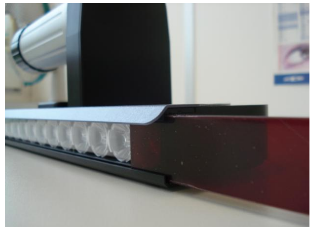
Color filters for contrast enhancement

Designed, developed and manufactured in Switzerland.