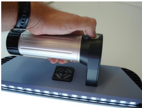
Easy handling and lightweight